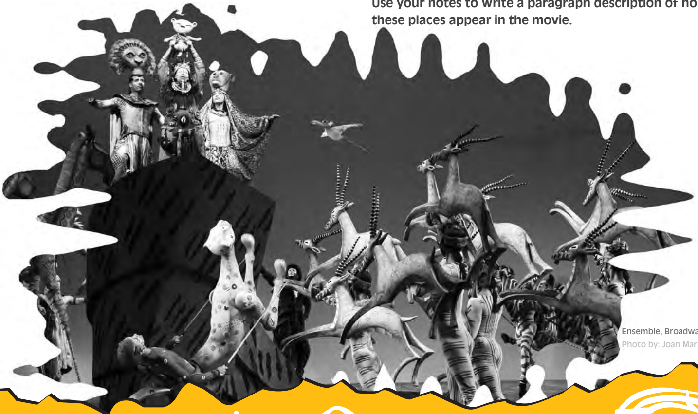
Ensemble, Broadway Company

Use your notes to write a paragraph description of how these places appear in the movie.