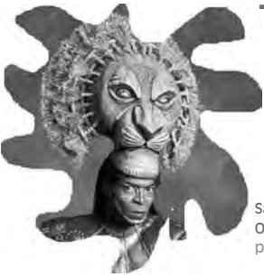
Samuel E. Wright, Mufasa, Original Broadway Company