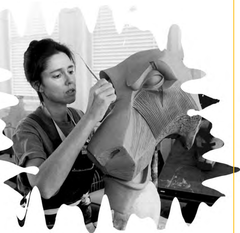
Julie Taymor

As THE LION KING opens we see lions, baboons, elephants, rhinos, zebras, giraffes, wildebeests, cheetahs, birds, all coming to honor the new prince and celebrate the unending Circle of Life . As we look at the animals, we can't help but see – humans? Yes, look closer – you can easily see the human performer under every animal costume and mask. The costumes are designed to reveal the actors' humanity within the animal portrayal.