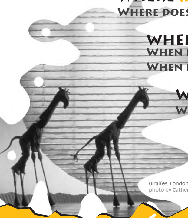
Giraffes, London Company