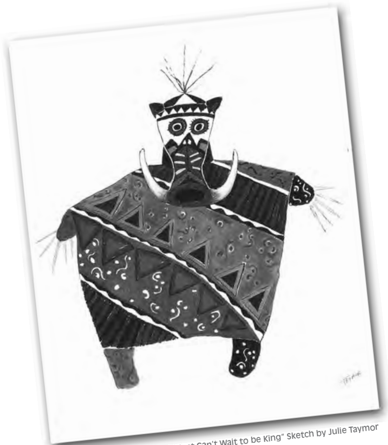
"I Just Can't Wait to be King" Sketch by Julie Taymor

Once all the teams are finished, each group should present its model to the class or group. Constructive criticism can be given: how might the team change its set design to better tell the story of THE LION KING?