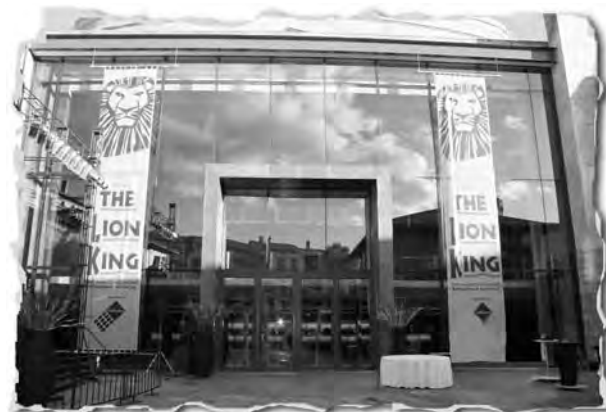
Montecasino Teatro, Fourways, near Johannesburg, South Africa

Ten years after THE LION KING opened on Broadway, the production returned "home" when it opened in Johannesburg, South Africa, at the Montecasino Teatro, a theatre built specifically to house the new production. The Lion King's story, music, even the language in many of the songs comes from South African lore. Just as Simba returns to claim his kingdom, the theme of "returning home" has great meaning for the South African people. In the 1950s, the South African government imposed apartheid, a cruel system of racial segregation. Apartheid was abolished in the early 1990s and the first multi-racial elections were held in 1994. For more information on South Africa's rich culture as well as its history of apartheid, check out the Johannesburg's Apartheid Museum at www.apartheidmuseum.org , or the the South African Tourism Board at www.southafrica.net/South .