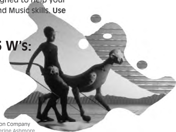
Cheetah, London Company